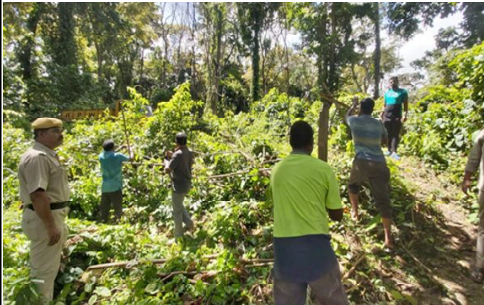
Port Blair, Oct. 16

During the visit of Deputy Commissioner, South Andaman to Shaheed Dweep, the people of the area reported about the encroachment of Govt. land. Based on the complaints, DC (SA) ensuring zero tolerance towards encroachment immediately issued strict direction to Revenue officials to remove the