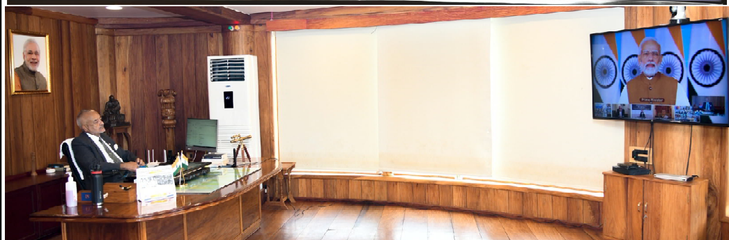
Admiral D K Joshi, PVSM, AVSM, YSM, NM, VSM (Retd.), Hon'ble Lt Governor, A&N Islands and Vice-Chairman, Islands Development Agency participated in virtual launch of Digital Banking Units by Hon'ble Prime Minister of India, Shri Narendra Modi dedicating 75 DBUs located in 75 Districts across Nation, including SBI, Mohanpura at Port Blair in A&N Islands to commemorate the 75 Years of Independence.